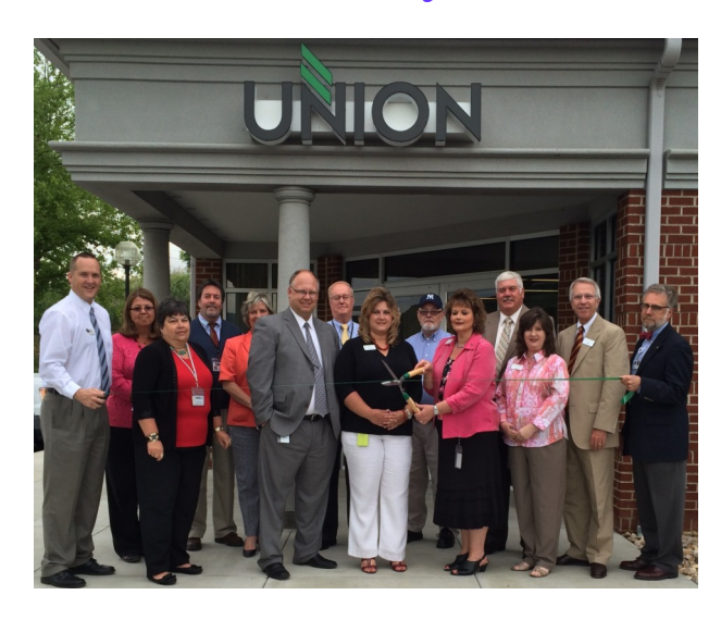
Union First Market Bank

Business Connection Third Quarter 2014 Newsletter