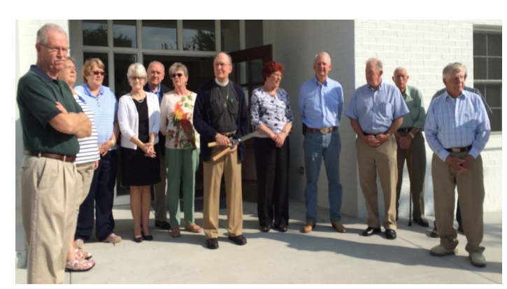
St. John's Episcopal Church Addition

800 E. Main St., Wytheville 276.228.4051; www.vec.state.va.us