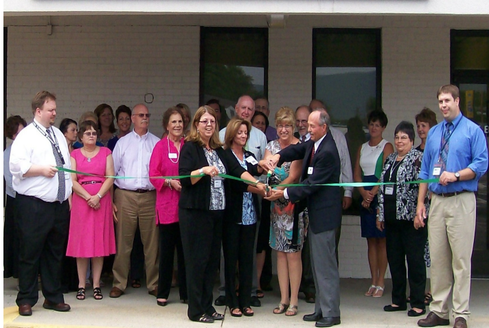
Virginia Workforce Center

800 E. Main St., Wytheville 276.228.4051; www.vec.state.va.us