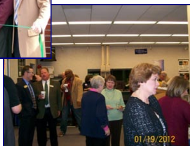
(Right) StellarOne Business After Hours January 19, 2012

Are you interested in starting a new business or expand an existing one in Bland or Wythe Counties? Are you having trouble accessing traditional loans up to $50,000?