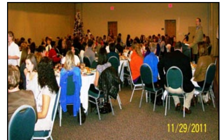
High School Business Etiquette Luncheon

Ribbon Cutting February 23, 2012 10:30 am