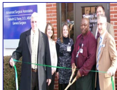
(Left) Ribbon Cutting Advanced Surgical Associates